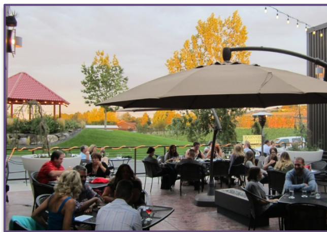
Barnard Griffin Winery