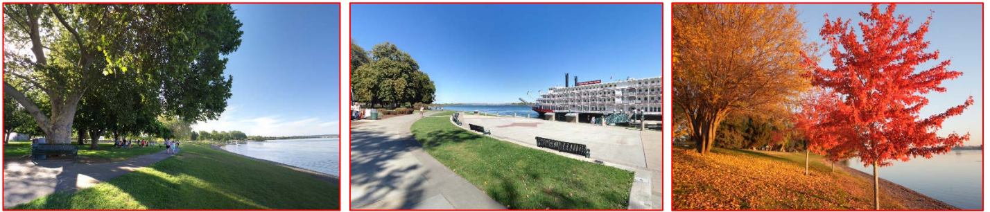
Richland's Howard Amon Park.

Welcome to the WSRO 2016 fall conference, Healthy Connections: Getting Active with TDM . We are so pleased that you could join us in beautiful Tri-Cities!